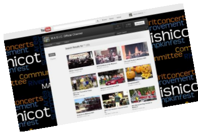
Mishicot videos online @ YouTube on the MishicotMAGIC page

Check Mishicot calendar online at www.mishicot.org or on the Mishicot Area Growth and Improvement Committee Facebook page